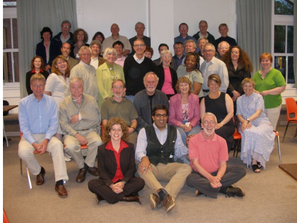
Figure 3. A photo artefact from the Second Multinational Forum of Teacher Scholars held in Prince Edward Island (STLHE Newsletter, no. 41, Fall 2005)

These multinational forums were held in conjunction with national conferences, including the American Association for Higher Education, the STLHE, and the Staff and Educational Development Association, before eventually becoming a regular part of the International Society for the Scholarship of Teaching and Learning. The second Multinational Forum held in Prince Edward Island was one of the largest gatherings, and it created a momentum to sustain meetings that resulted in strengthening lasting networks in other international organizations, including the International Consortium for Educational Development. In 2016 at the House of Lords in England, the International Federation of National Teaching Fellows was officially recognized, with the 3MNTF having played a pivotal role in its development.