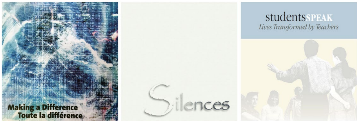
Figure 2. Covers of the 3M Council's three book publications: Making a Difference (left), Silences (center), and Students Speak (right)

Over the years, the 3M Council assumed a role that was central to the broader impact of the fellowship program through the development of several national initiatives to advance teaching and learning in higher education. These included three book publications with contributions from nearly 100 fellows (Figure 2), the Scholarship of Leadership in Education grant to fund collaborative educational leadership initiatives by 3M fellows, a speakers list of 32 fellows, the aforementioned Postcard project to commemorate the meaning of the fellowship on its 25th anniversary, and several key partnerships with a number of external organizations. For example, the fellowship program's partnership with Maclean's magazine was seen as the most influential partnership in that it brought "national prominence to excellence in teaching and educational leadership."