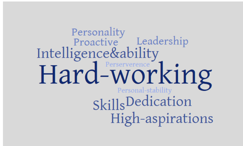
Figure 2. Word-cloud of perceived qualities of high-achieving students drawn from respondents' comments