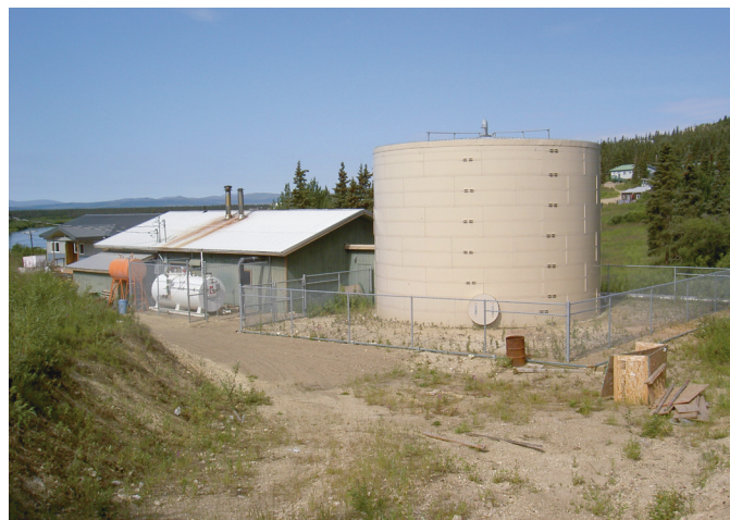
FIG. 3. Water tank in White Mountain, Alaska.

In White Mountain, a well was drilled as early as 1964, followed by another well in 1968. By 1986, a piped water delivery system was installed, and upgrades have occurred continuously since then. The well currently in use was drilled in 1968 and is 129 feet deep. Information provided by community members in 2004 indicates that the original well, drilled in 1964 to a depth of 118 feet, was contaminated with oil. The newer well, 400 feet up a hill from the original 1964 well location, is pumped continuously at 24 gallons per minute to meet demand and keep a 150 000-gallon storage tank full. Major upgrades were made around 1981, including a new water plant and tank, with pipes following within a few years (Fig. 3). When the 1981 water plant was installed, the design population was 250 people, with a per capita use of 15 gallons per day. The distribution system has one loop serving the town, and continuous pumping prevents freezing. The water system and washeteria are operated by the municipal government. Water is filtered, chlorinated, and fluoridated (ADCCED, 2004a; authors' field notes). Piped