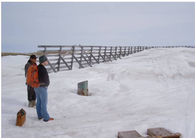
FIG. 2. The lined water catchment of Shishmaref, Alaska, surrounded by a fence. An engineering graduate student and a Shishmaref resident are surveying the outer area of the community's potential water supply.

Shishmaref's central water system is operated by the municipal government. The water system consists of raw water collection, water treatment, a washeteria, a central watering point, and water delivery by vehicle. The washeteria, an important central location in many villages, is the building that houses the water treatment plant, as well as public showers, toilets, and washing machines. Raw water to supply the system comes from a surface water source and is filtered and chlorinated (ADCCED, 2004b). Shishmaref's surface source is a lined catchment area, on one side of which snow fences were built to enhance snow catch (Fig. 2). Snowmelt is then retained at the surface for use. Treated water is stored in a 300 000 gallon tank. A project in progress is installing household plumbing and a flush/haul system. Those households with tanks installed can have water delivered, and others can haul water from the watering point at the washeteria. Waste is deposited in sewage lagoons via sewer pipes (several public buildings), honey bucket haul, or flush tank haul.