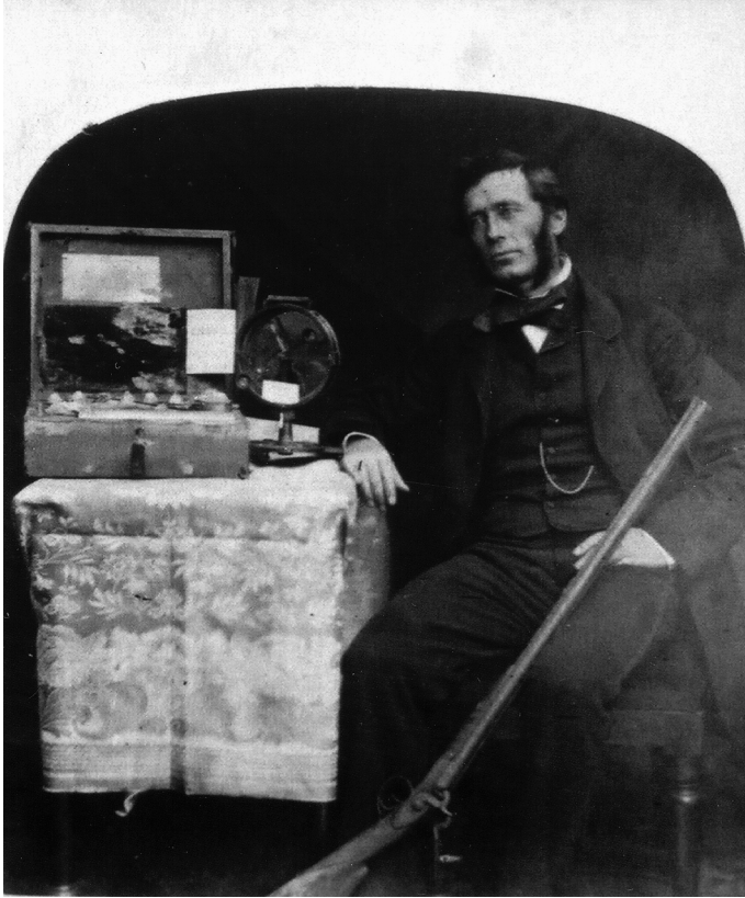
FIG. 1. Captain M'Clintock with some of the Franklin expedition relics (Cheyney, 1860).

entitle you to every feeling & every demonstration of gratitude.