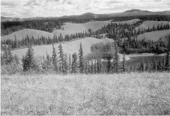
FIG. 2. Grasslands near the north end of Aishihik Lake.