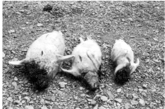
FIG. 2. Range of size and condition of ringed seal pups harvested in western Prince Albert Sound on 23 June 1998 (left, female BMI = 23.6, standard length 86.4 cm; center, female BMI = 17.2, standard length 77.5 cm; right, male, BMI = 16.8, standard length 64.8 cm; mean BMI for all pups sampled in June 1998 for which BMI could be calculated = 20.2, n = 44 ).

This poor condition of pups during June 1998 was noted by the seal monitor, who reported six seal pups in the June sample as “skinny” and in “poor condition,” as well as reporting three seal pups washed up dead along the shore