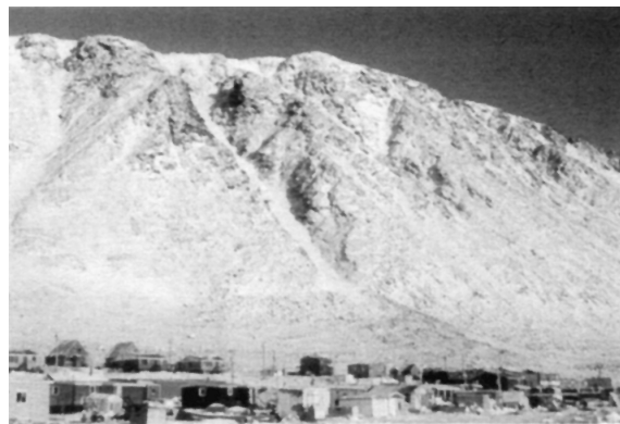
Ausuittuq (Grise Fiord), Ellesmere Island. (J. Kobalenko)