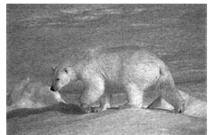
Polar bear.