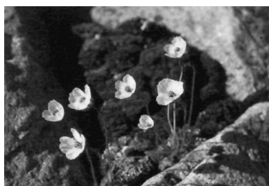
Arctic poppy ( Papaver radiculatum ). (P. Schledermann)