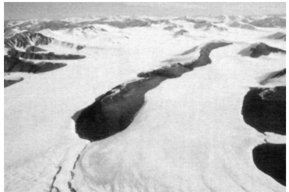
Ice cap on northern Ellesmere Island. (J. Kobalenko)