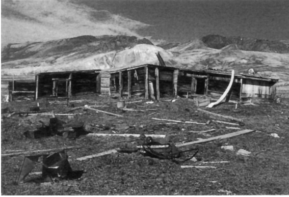
Peary's huts at Fort Conger, Ellesmere Island.