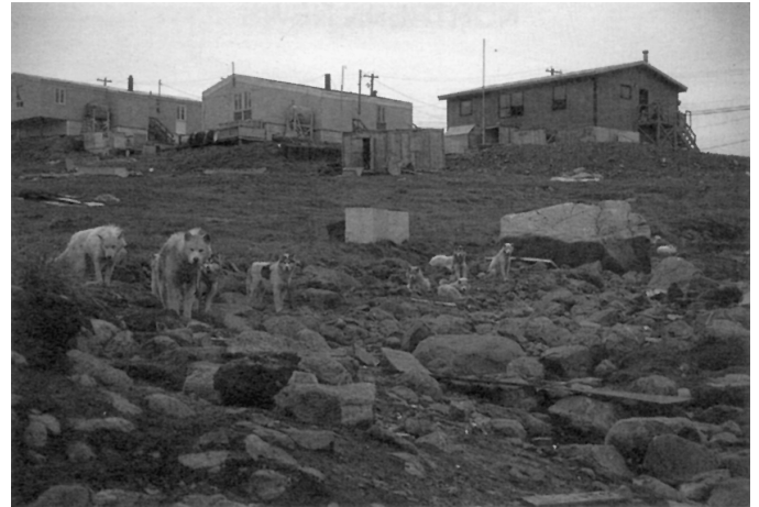
Sled dogs tied up near the beach at Pond Inlet, August 1998. (K. McCullough)