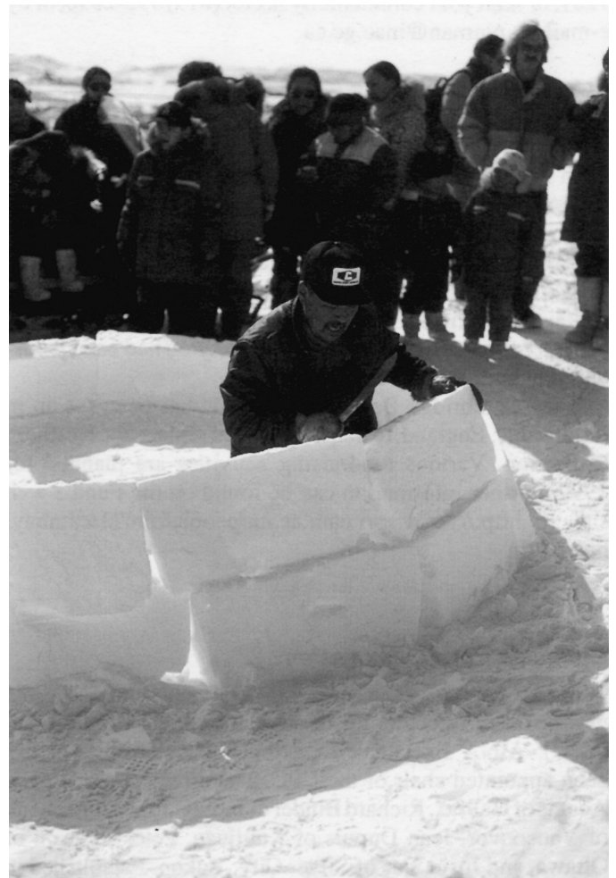
Toonik Time iglu building contest in Iqaluit. (D. Stenton)