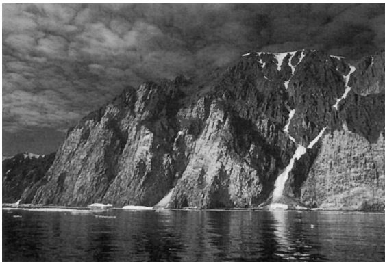
Cambridge Point, Coburg Island, June 1979. (D.G. Reid)