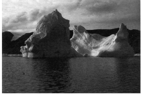
Iceberg in Alexandra Fiord, Ellesmere Island.