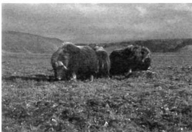
Muskoxen on Truelove Lowland, August 1998.