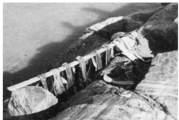
Drying char at Omingmaktok (Bay Chimo). (J. Crump)