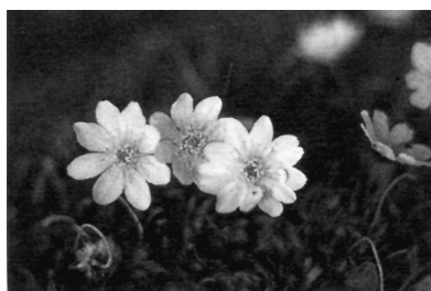
Mountain avens ( Dryas integrifolia).