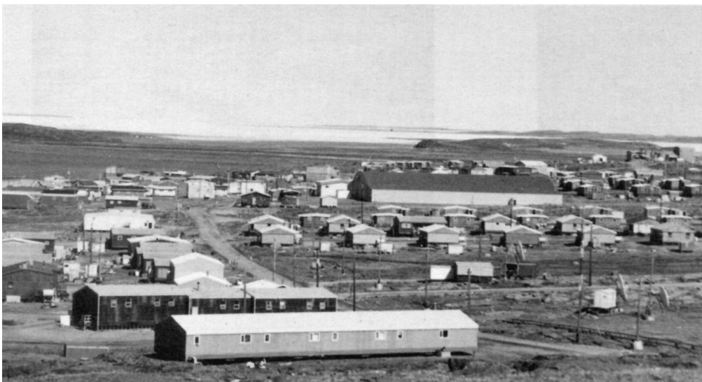
Kugluktuk (Coppermine). (J. Crump)