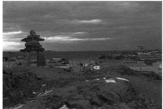
Kangiqslineq (Rankin Inlet). (M. Goodjohn)