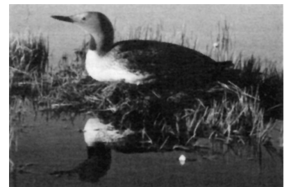
Red-throated loon on the nest, Devon Island. (T. Nail)