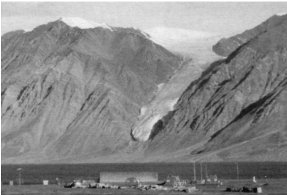
Tanquary Fiord, Ellesmere Island. (J. Kobalenko)