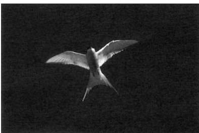
Arctic tern. (P. Schledermann)