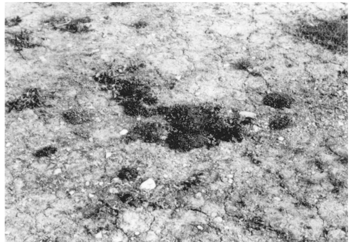
FIG. 4. Cushions of Silene acaulis showing the process of recolonization on the airstrip (14 August 1991).

the Pass. The more exposed and well-drained moraines have only a few scattered plants, for example Poa glauca , Carex nardina , Potentilla hookeriana , and Saxifraga oppositifolia , whereas areas with a prolonged snow cover are characterized by Ranunculus pygmaeus , Minuartia biflora , Erigeron humilis , Taraxacum arcticum , and Melandrium apetalum . There are a few sheltered herb slopes with low arctic species such as Botrychium lunaria , Thalictrum alpinum , Sibbaldia procumbens , Gentiana tenella , and Taraxacum brachyceras . Fens with Eriophorum triste , E. scheuchzeri , E. callitrix , Arctagrostis latifolia , Carex bigelowii , and C. saxatilis follow the small rivers and cover wet depressions.