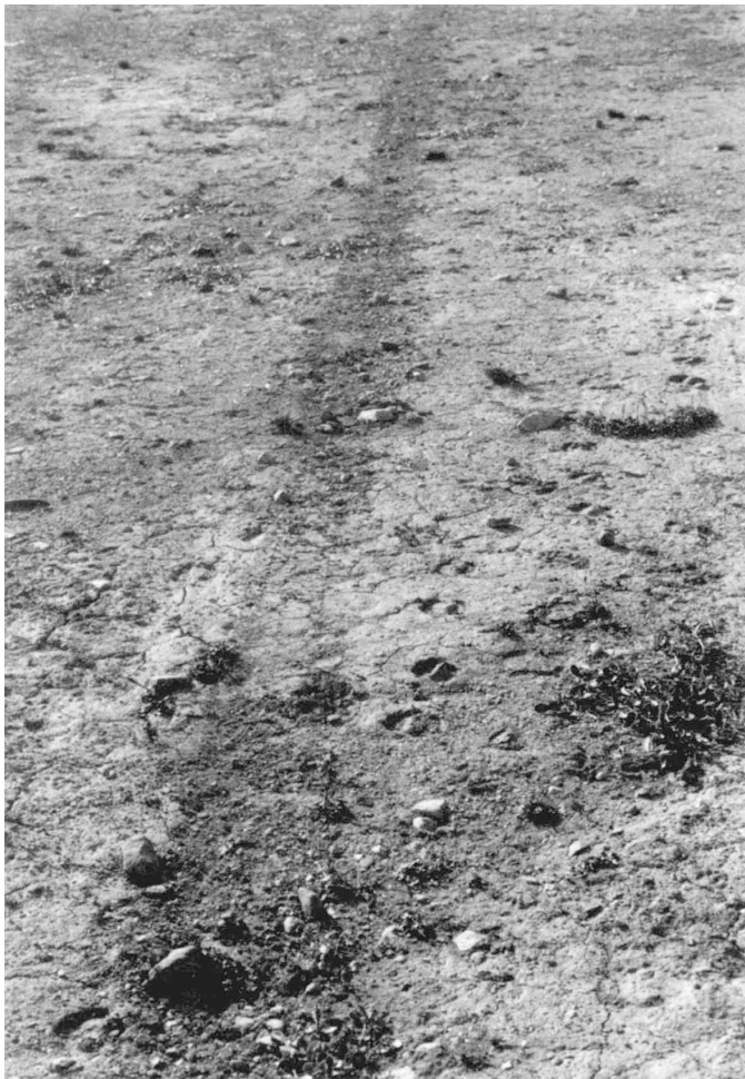
FIG. 3. Surface of the airstrip. Tracks of the Twin Otter and prints of hooves of a musk-ox show the structure and consistency of the soil (3 August 1991).

vegetation of the unglaciated area of Jameson Land, with sedimentary rocks, and the mountain vegetation of the granitic Staunings Alper, with peaks up to 2930 m and many glaciers of alpine type.