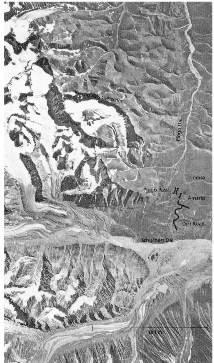
FIG. 2. Map of the Pingo Pass area based on the aerial photo 1:150 000, 7 August 1987. (FK nr. 87.716MM 888-M-11239), reproduced with permission of the Danish National Survey and Cadastre – Denmark.

Precipitation and accumulation maps published by Ohmura and Reeh (1991) show that the total annual pre-