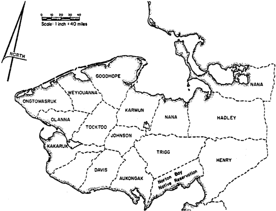
Fig. 1. Reindeer Grazing Permits, Seward Peninsula. 1976 Boundaries Approximate.

totalling approximately 17 400 animals, representing 75% of the reindeer estimated in Alaska, were on the Seward Peninsula.