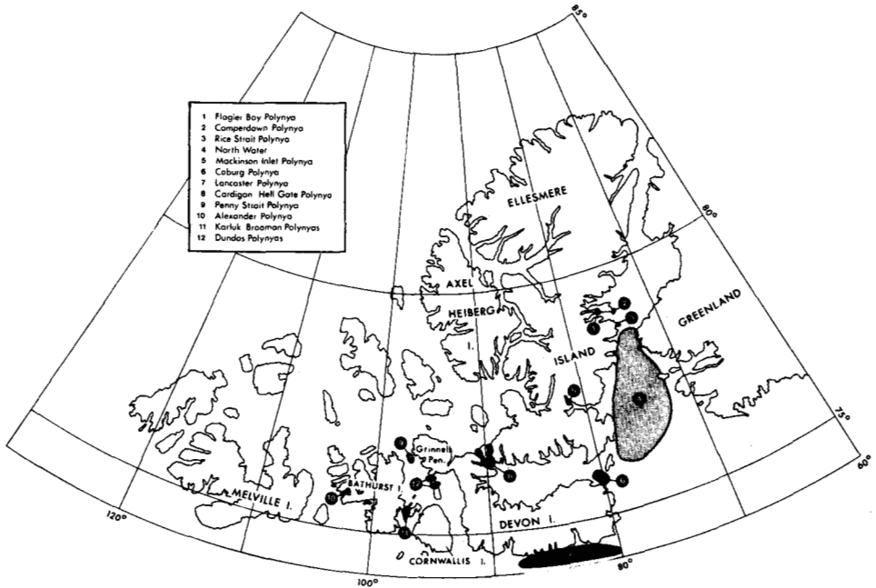
FIG. 1. Polynya locations in the Canadian High Arctic.

same position every year it is called a recurring polynya." This paper deals principally with the recurring polynyas although a few statements are made regarding what I have termed secondary polynyas for lack of better terminology. By secondary polynya is meant an area which appears to become ice-free several weeks earlier than the occurrence of regular regional breakup. Obviously the distinction between these two types of polynya may in some instances be difficult to define, but as a rule the primary recurring polynya is established one or two months prior to general breakup of the fast ice whereas the secondary polynyas appear only a few weeks before this event.