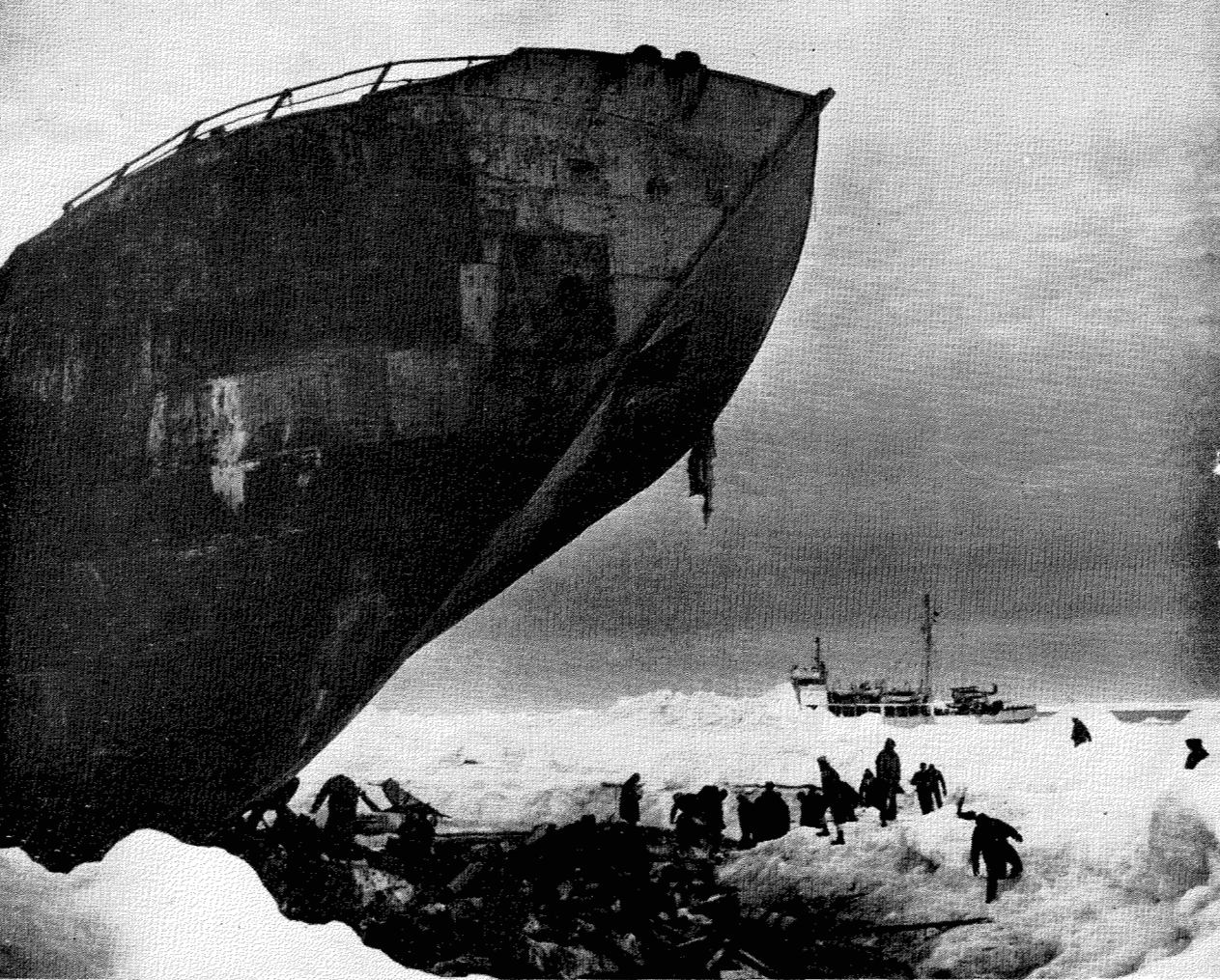
Coburg, beset and abandoned, inspected by party from U.S.C.G.C. Northland, in background.

his 8-man detachment behind, the captain advanced alone and “saw a well supplied and well fortified base. While watching the changing of sentries, which took place every half hour, he was surprised from the rear by a bearded Nazi officer”, (Coast Guard, p. 180) whom he killed in a gun duel; the captain then withdrew with his patrol in the face of superior force.