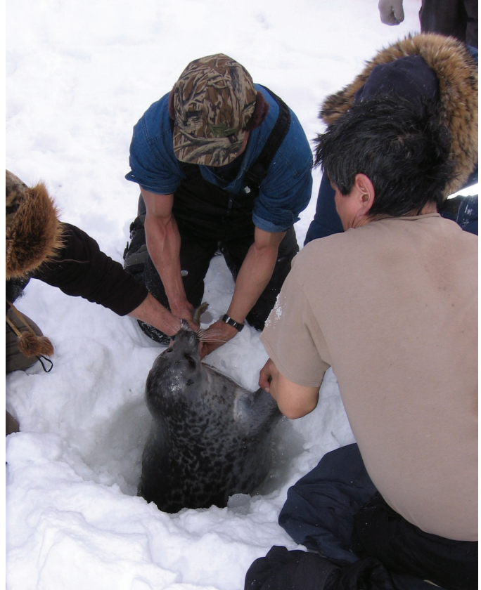
FIG. 3. Community technicians from Tuktoyaktuk, Northwest Territories, pulling a live-captured ringed seal from a net set in a breathing hole. This seal was instrumented with a satellite-linked transmitter and released at the same location, and its movements were tracked for three months.

Working together, the scientist and the harvesters can discuss and determine the expected sample size and sample composition (by sex or age class, for example) for a range of appropriate parameters (e.g., fish length, weight, fishing effort). Measurement of biotic and abiotic factors that are meaningful can be included as “value added”; however, care must be taken that the time, equipment, and resources needed to collect the ‘extra’ samples or measurements do not overshadow collection of the primary samples, tissues, or information. For example, it is sometimes possible to collect water level data using a simple staff gauge and record water levels daily along with water temperature, without compromising the basic data collection tasks (e.g., Sandstrom and Harwood, 2002).