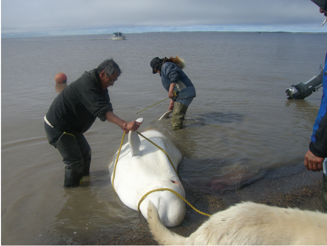
FIG. 2. Community monitor preparing to measure the fluke width of a beluga whale landed in the subsistence harvest near Tuktoyaktuk, Northwest Territories, Canada.