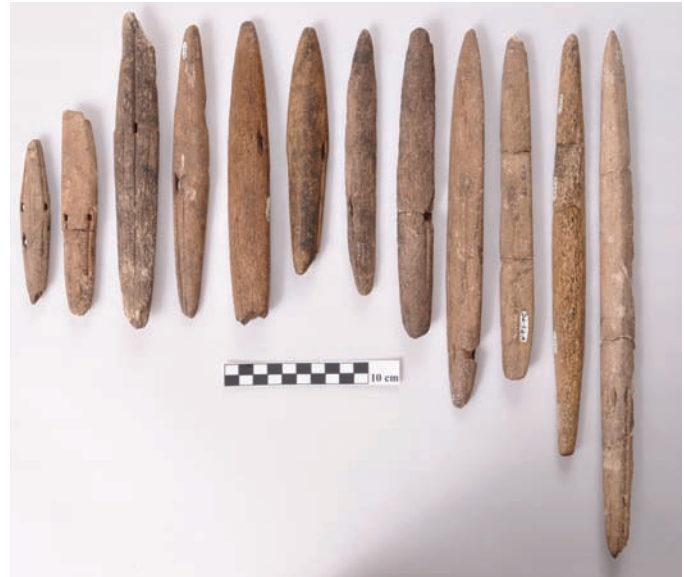
FIG. 6. Foreshaft-like tools. Note variation in size and shape and the number and position of line holes. All examples are manufactured from whale bone.

A search of northern ethnographic literature turned up a similar tool used for making and repairing fishing nets among 19th-century Bering Strait groups (Nelson,