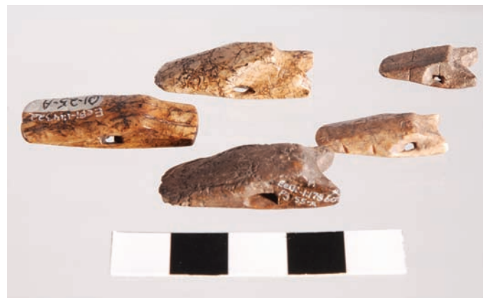
FIG. 3. Line fasteners. Note that all but one example have flared proximal ends, tapered distal ends, and line holes running through the bodies of the tools.

Line fasteners may have had a decorative or emblematic function, but there are examples of similar form from unrelated cultural contexts that could indicate their function as part of composite harpoons. They resemble 19th-century shaft attachments collected by Edward Nelson from