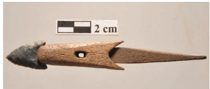
FIG. 7. Typical endblade-tipped harpoon head and foreshaft from Phillip's Garden.

1899:192). These examples were long, narrow, bone tools with tapered ends and wide midsections with line holes. While the faunal remains at Phillip's Garden include fish, the foreshaft-like tools may have been used for making nets to capture harp seals. Today the harp seals make their way out of the Arctic and through the Strait of Belle Isle in the early winter, traveling through open water to the Gulf of St. Lawrence. On their spring migration north after the birth of their young, the seals often travel through channels in the spring ice that usually occurs close to land on this coast, and they are known to haul out on land from time to time. In the recent past, people on the coasts of Newfoundland and Labrador typically hunted harp seals with nets during the winter migration (LeBlanc, 1996). It is possible that people could have hunted seals using nets as well as harpoon technology at Phillip's Garden; however, this interpretation remains speculative.