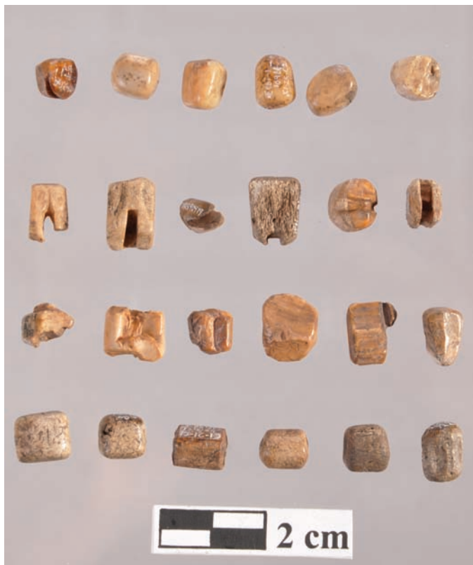
FIG. 2. Polished bead-like pieces showing a variety of shapes and materials.