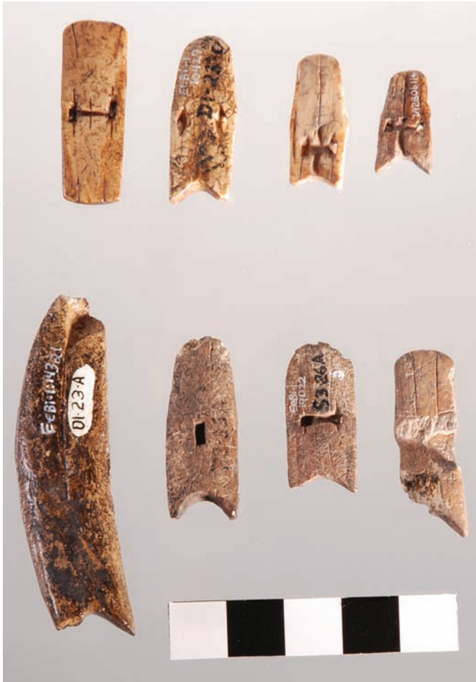
FIG. 5. Ventral surface of line fasteners showing decoration on some examples. Top row, third from the left shows a series of incisions through one central incised line running proximal to distal. Parallel pairs of incisions are apparent on the top row, left, and on the two examples in the bottom row at right.

usually occurring singly and typically placed midway along the length of the tool and off-centre. A groove is usually carved from the line hole to the tapered end, probably to allow the line to lie flat against the surface so that the tapered end can fit into some type of socket.