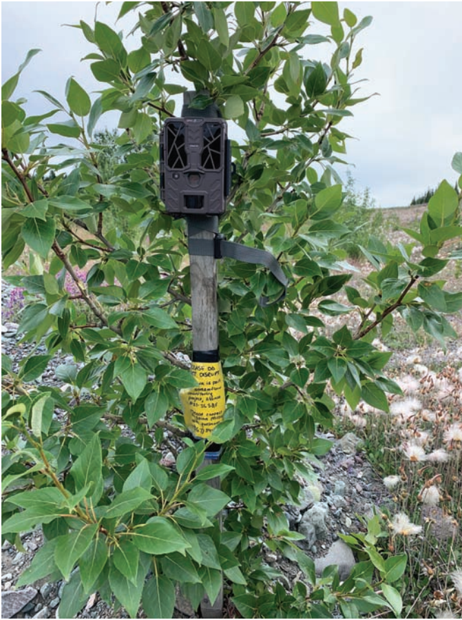
FIG. 4. Game camera and note with contact and project information.

to them becoming interested in the research. She said that it, “[introduces] the idea of research professionally to the locals, showing that it’s cool...[and] the researcher gets a whole new introduction to the environment and things they didn’t know.”