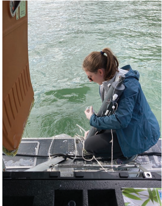
FIG. 5. Author collecting a water sample from the plane float in a location on Lhù'ààn Mân' that would have been difficult to access without the plane, 28 July 2021.

I’ve definitely seen a shift research-wise in the last decade or so [...] it depends on the personality and the allotted time, if you only have two weeks and you’re busy then it’s really hard to make a connection with the community but there is a willingness on all ends. The