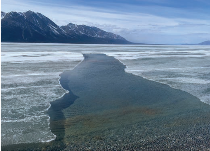
FIG. 2. Ice breaking up on Lhù'ààn Mân', 11 May 2021.

this when you're here for two weeks, that's just a snapshot, you need time to walk up the creek, to see where the water is going." Getting to know the study area intimately leads to observing changes on different scales and in different contexts and enhancing the final research project.