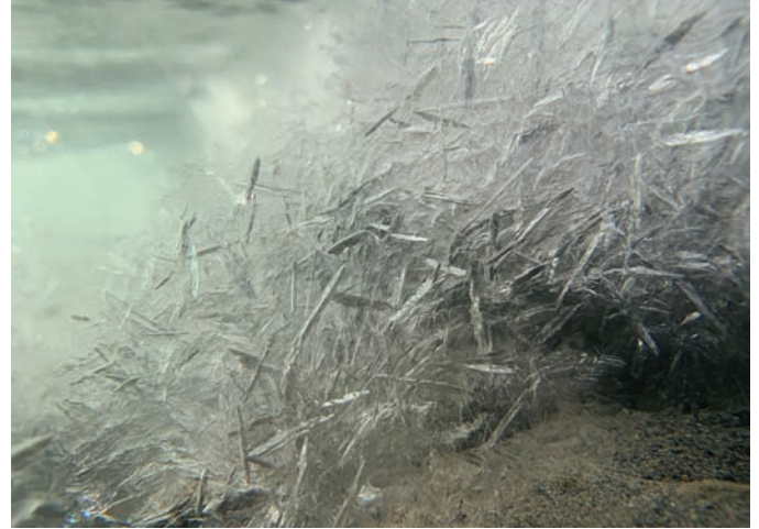
FIG. 3. Ice forming on the bottom of Tasààn Zhat Chù' (Copper Joe Creek), 6 October 2021.

I deployed game cameras to collect observations of streamflow changes in the creeks, and with each camera I attached a note with my research license number and contact information (Fig. 4). Pauly said, "There are lots of