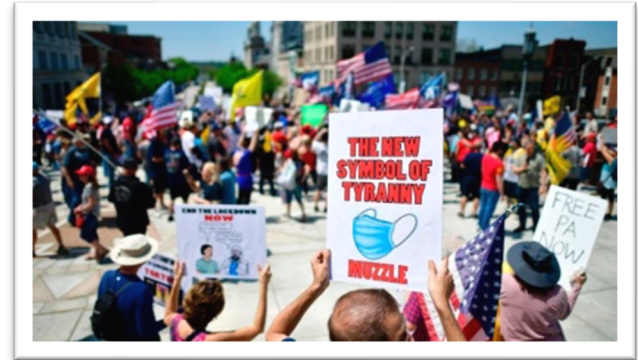
Figure 3.. A demonstrator holds a placard with a face mask stating, “THE NEW SYMBOL OF TYRANNY MUZZLE.” People had gathered outside the Pennsylvania Capitol Building to protest the continued closure of businesses due to the coronavirus pandemic on May 15, 2020 in Harrisburg, Pennsylvania. 110

The discourse of mask as a symbol of rights and freedoms was constructed in opposition to the idea perpetuated with the circulation of the discourse of mask as PPE. The later discourse was deployed in efforts to limit the virus’ spread by appealing to the individual decisions of millions to comply with public health directives to wear masks in public. As bioethicist Nancy Kass, deputy director for public health of Johns Hopkins University’s Berman Institute stated, “masks can be a form of virtue-signaling. By wearing a mask, people show their concern for keeping other people safe.” 42 Habitual mask wearing is constructed as a civic duty in the discourse of face mask, both to protect others and to take responsibility for oneself, especially seen in Eastern Asia cultures, such as China and Japan. An article by the South China Morning Post acknowledged that “wearing face masks is often seen as a collective responsibility to reduce disease transmission and can symbolise solidarity.” 43