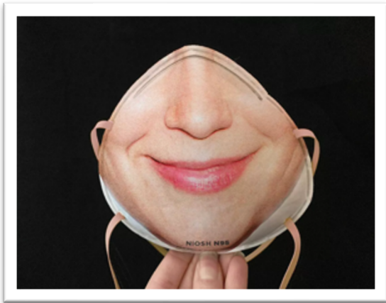
Figure 5. A San Francisco designer created “Resting Risk Face” masks by custom-printing the respirator masks with images of wearers’ faces. It has been advertised as “be protective and be recognized. It’s so easy.” 111

The face and by extension face coverings, have always been constructed with both denotative and connotative meanings related to social communication. 64,65 In North America for example, 66 masks were constructed as barriers to communication during the pandemic because they jeopardized people’s ability to judge facial expressions. 65,66 In contrast, the anonymity offered by face masks was presented as helping people to keep desired social distances in East Asian cultures, 67 where it is perceived as polite and modest not to show obvious emotions. 56,68 Face masks were used to send messages and carry messages throughout the pandemic. A dichotomy of being hidden versus being visible grew out of the face mask as stigma discourse. The common place use of masks in some parts of the world turned it quickly into a popular culture item. For example, Korean and Chinese celebrities often lead public fashion discussions on the face masks they wear. 69,70 Amidst the pandemic and with the broad adoption of masking around the world, face masks emerged as a new genre of fashion accessory, and an expression of personal style, and were sold by all clothing companies. 71 The U.S.-based online marketplace Etsy says its total sales doubled in April 2020, mostly from face mask sales. 72 Masks were also turned into an object for political communication as protestors printed messages on their masks to march in response to George Floyd’s death. 73