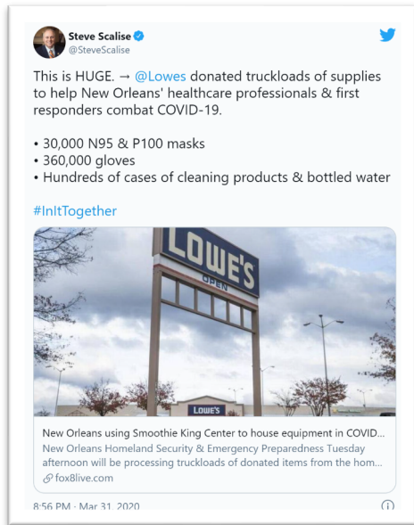
Figure 2 Lowe's announcing that large shipments of PPE are donated to the HCP. Large corporations such as Lowe's, Home Depot, and Target donated PPE to the hospitals and first responders. 31