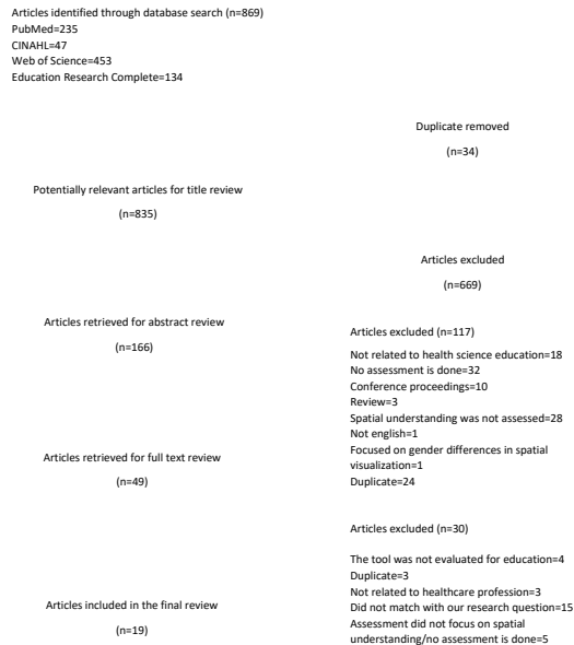
Figure 1. Flow diagram explaining the study selection process