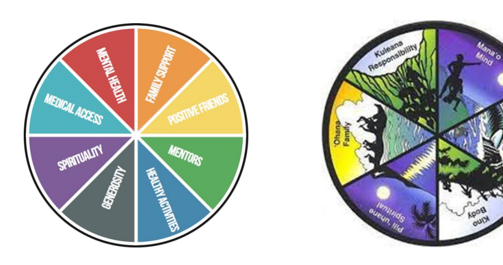
Figure 3. Components of the Sources of Strength Wheel (Sources of Strength (2021) and Lōkahi Wheel (Kamehameha Schools, 1995)

Our findings also suggest that the SoS wheel is similar to the Lōkahi wheel, as depicted in Figure 3. The Lōkahi wheel was designed based on a holistic worldview that the body, environment, and spiritual realm are interconnected (Kamehameha School Bishop Estate Extension Education Division, 1995). One must remember that we are never alone and must respect and maintain spiritual connectedness with nature--the 'aina (land) and kai (ocean). It also reminds us to remain connected to and appreciate Ke Akua (the God) and 'aumakua (ancestors).