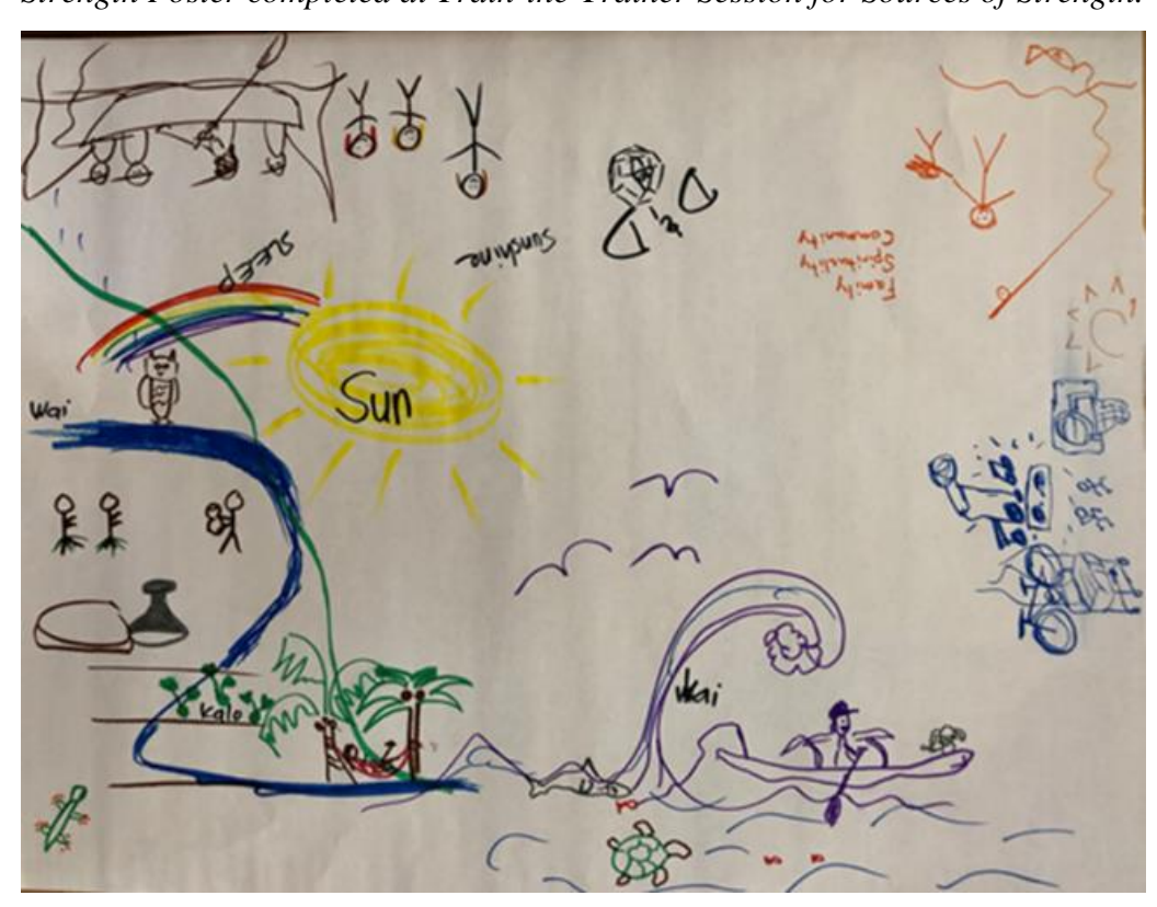
Figure 1. Strength Poster completed at Train-the-Trainer Session for Sources of Strength.

Two hundred seventy-nine youth and supportive adults participated in the strength poster activity during the program, with some duplication. This activity was done as the first session for the supportive adult training and the youth meetings, prior to the introduction of the SoS wheel. Youth leaders also shared this activity as part of their hōʻike (to show or exhibit) events with family, friends, and community. The posters were anonymous containing only team names. Fortynine teams were created with group sizes ranging from 4-8 members. Six team names (12.2%) referenced place such as Nānākuli Dreamers, Waiʻanae Strong or Rainbow Valley. Six team names contained the word manaʻolana or hope; four teams included family such as 'Ohana Sunbeams or 'Ohana Crew, four included aloha or love, and four others included spirituality such as Amazing Grace and the Guardian Spirits.