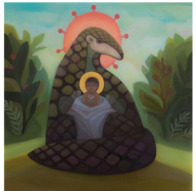
Figure 8: The Pangolin Prophecy (2020).