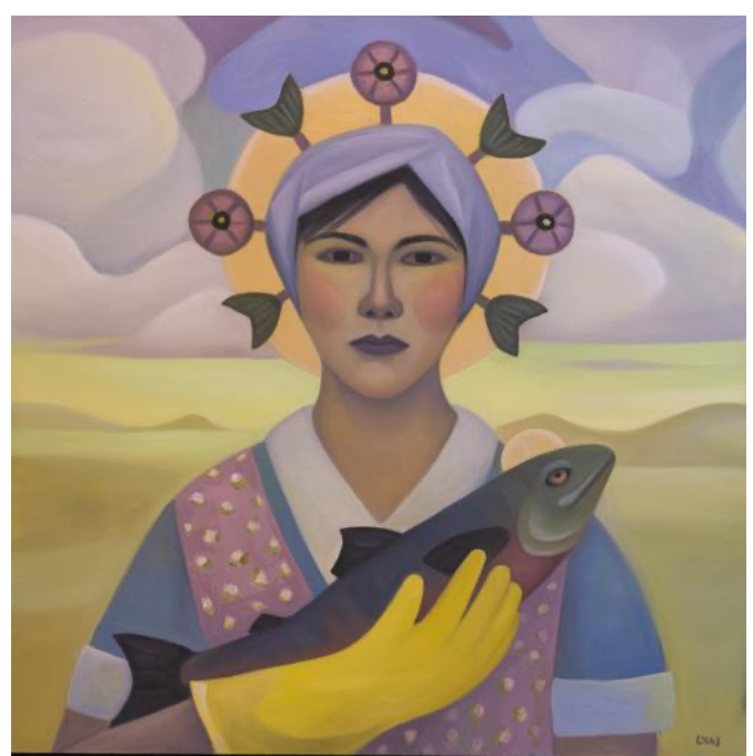
Figure 6: Our Lady of Karluk (2017).

A Native woman in an industrial outfit holds a sanctified salmon in Our Lady of Karluk (Fig. 6). King salmon ( Oncorhynchus tshawytscha ), also known as chinook, spawn in the Kodiak region. They are only indigenous to the Karluk and Ayakulik rivers, both on southwestern Kodiak Island. Their annual arrival in the archipelago symbolizes the beginning of the salmon fishing season. According to Alutiiq worldview, the first fish captured each year had to be entirely consumed, with the exception of its gills and gallbladder. This showed reverence for the animal and ensured an abundant future supply of fish (Alutiiq Museum 2020). Only about 13,500 of these fish return to the archipelago's streams each year.