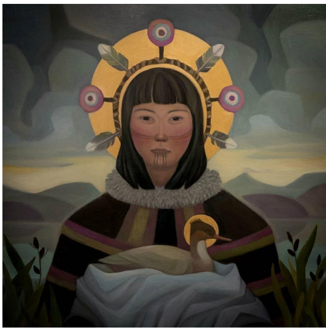
Figure 5: Sea Birds Merganser (2018).

The Kodiak sky, land, and water are brought together by the merganser in Sea Birds Merganser (Fig. 5). The merganser is particularly a symbolic bird that is spiritually powerful in the Alutiiq universe as they can travel through all layers of the universe through the air, land, and in the ocean. Birds were often the personal helpers of Alutiiq hunters and bird imagery is common in Alutiiq art. Lyons shares: