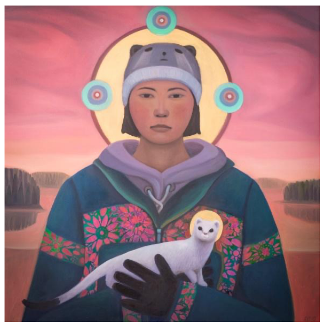
Figure 7: Llam Sua (2019).

Llam Sua (Fig. 7), the spirit of all things, is represented by an Alaska Native youth and her marten (or short-tailed weasel) companion in this icon. According to the Alutiiq cosmology, the universe is comprised of five layers revealed by concentric circles (different layers of the universe), the center of which is occupied by the all-seeing Llam Sua. In this worldview, everything is interlinked, and everything has a human soul ( sua ; literally, "its person"), cultivating equal multispecies relations. Lyons emphasizes the importance of portraying the reality of Native youth life in rural Alaska. This icon captures the moment in which Llam Sua manifests itself in the eyes of an Iñupiaq teenager from Shaktoolik, Alaska, where Lyons visited in 2019. Shaktoolik is an Iñupiaq community in the Nome Census Area in Alaska. The community's population is 212 (2022), and the settlement is one of the coastal Alaskan communities threatened by erosion and related climate change and sea-level rises it had been relocated twice in the past. The Iñupiaq youth, as an embodiment of Llam Sua, is not adorned in