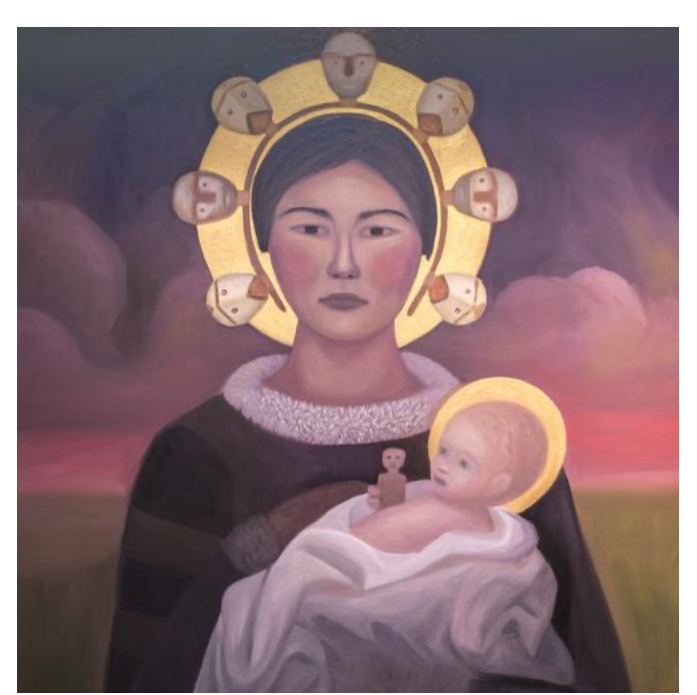
Figure 4: The Alutiiq Madonna (2017).

The Indigenous Mother embraces a blue-eyed blonde Child (Fig. 4). His right hand holds an artifact, shaman figurine excavated in the Karluk-1 archaeological site, a site of primary importance in defining the late prehistory of the Kodiak archipelago, in particular the Koniag tradition. The halo around the Mother's head is trimmed with historic masks from the Pinart Collection, a legacy of the French anthropologist Alphonse Pinart who traveled to the Kodiak archipelago in 1872 to collect the most extensive number of Alutiiq ceremonial masks. In May 2008, thirty-four of the ceremonial masks from the collection travelled back to Kodiak for an exhibition at the Alutiiq Museum, which facilitated the initiative for cultural revitalization including language preservation and expressive culture including masking, dancing, singing, and drumming in the community. Lyons states: