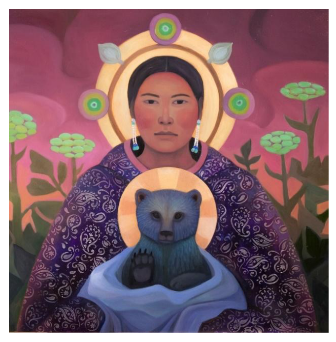
Takuqa'ak: A Bear's Blessing (2018)

Lyons's portraits decentralize human experiences. Each human and nonhuman other in her work radiates a fresh energy to dance off the canvas. This embeddedness reflects Alutiiq relations with the wildlife, which deeply intersects with human lives, drawing a full circle of entangled relationships. In what follows, I will discuss six portraits from Lyons's Alaska Native icon portrait series to highlight the idea of love, resilience, and sovereignty.