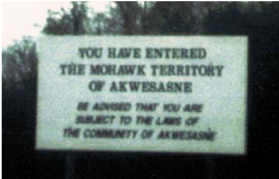
Elements of Operation FEATHER enter Akwesasne on 2 May 1990.