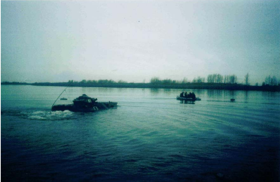
1RCR Grizzly Float Tests, Operation FEATHER.

As the overall threat to LEAs was diminished thanks to patrolling and checkpoints, the CF commitment was reduced. By 25 May the CF contingent at Akwesasne consisted of 89 personnel, 35 vehicles and 9 marine vessels. 62 All but three personnel from 2 EW SQ and 1 Int Coy returned to Kingston between 13 and 16 May, and most of the secure communication equipment was withdrawn on 18 May. The threats to both LEA personnel and Mohawk inhabitants, however, were not completely negligible. Although the CF contributions to Op AKWESASNE were reduced, the CF was still required to provide immediate armed assistance resources, in addition to, offering operational equipment and administrative support. 63