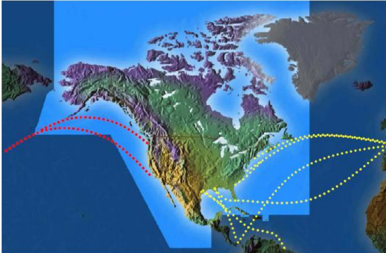
Figure 1 – Great circle routes