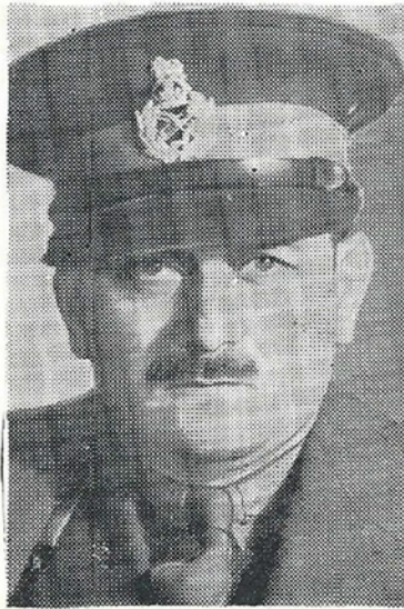
LT.-GEN. CHARLES FOULKES

I N many communities from coast to coast, Canadians will be gathered together, as we are here tonight, to commemorate this great day in the history of our country. No citizen can look with more justifiable pride, than you in Calgary, on the word "Vimy" emblazoned on the regimental colours of your units. Appreciating, as I do, the magnitude of your contribution to the Allied success of 1917, I feel no greater honour could be accorded an infantryman than the privilege of being your guest speaker on this occasion.