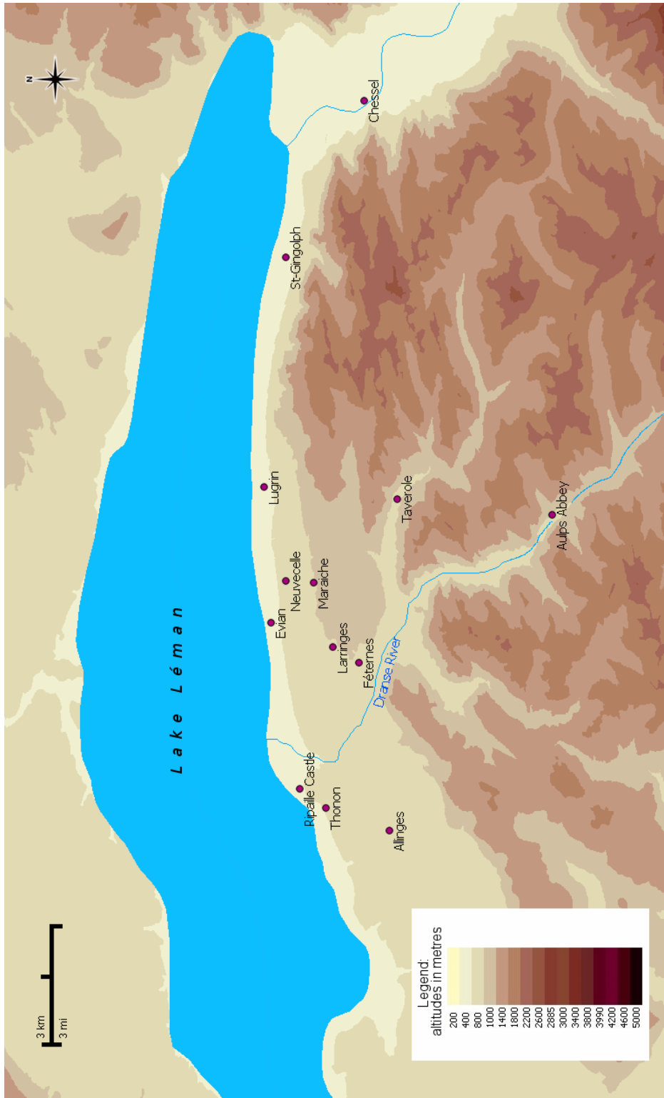
Figure 2. Map of the castellary of Evian-Féternes.